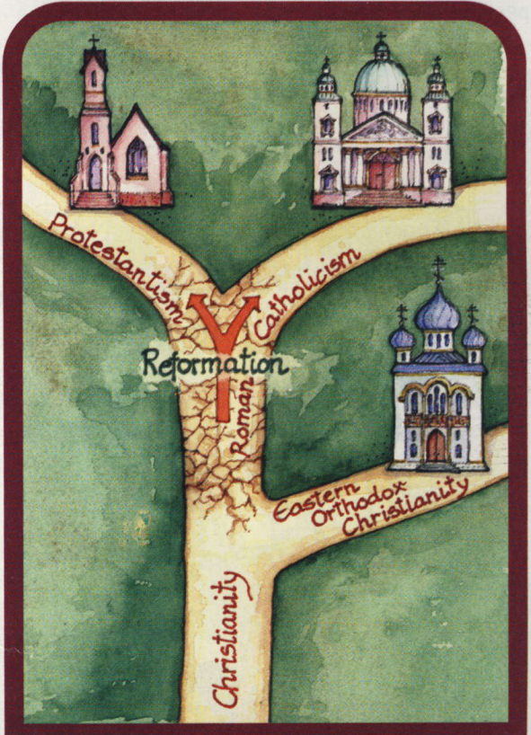
Use this illustration as a graphic organizer to help you explore the causes and spread of the Reformation.

In this chapter, you will learn more about the problems that weakened the Catholic Church. You'll meet early reformers who tried to change the church. Then you will learn how a German priest, Martin Luther, ignited the movement that ended the religious unity of Europe. Finally, you'll read about other early leaders of the Reformation.